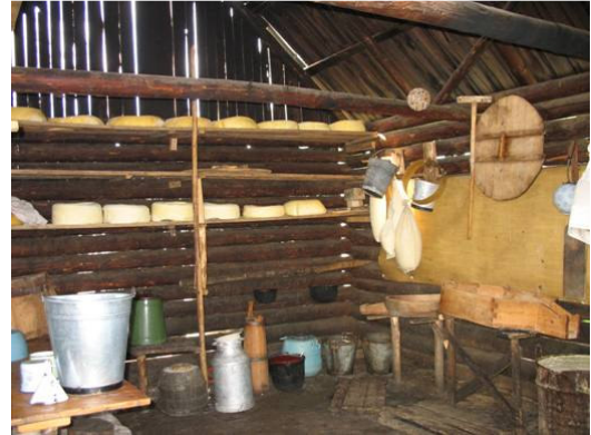
Sheepfold in Bucovina

After breakfast we climb the round mountains of Bucovina, covered in forests interrupted only by green meadows and haystacks, to arrive after about 2h of gentle walking to a sheepfold. Here we get acquainted with the process of cheese making, see how every day life is in a temporary settlement and get to understand the fragile truce between the Romanian shepherds and their fierce dogs, and the 7000 bears and 3000 wolfs inhabiting the Romanian Forest, the largest system of unbroken forests in Europe. We have a tasty lunch made of mamaliga – the Romanian polenta - and cheese, in these places that seem to escape the passing of time.