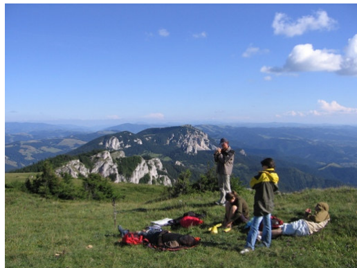
Hasmasu Mare Peak

In the morning we visit Bran Castle (also known as Dracula`s Castle ), a beautiful 14 th century castle, restored in the 19 th century to its former glory, by the royal family of Romania. We drive towards Brasov (Kronstadt) , one of Transylvania`s major cities. We walk the medieval centre, one of the best preserved in Romania, housing The Black Church , the biggest church between Vienna and Constantinople, the City Council Square , the ramparts erected in medieval times by the Saxon colonists , and one of the narrowest streets in Europe, The Binder Street . We have lunch in a Romanian restaurant and then head north towards The Eastern Carpathians .