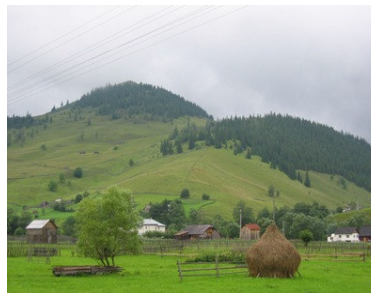
Moldovita village after rain