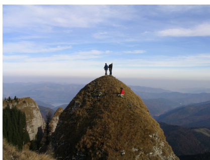
Near Ocolasu Mic Plateau

We reach the plateau at an altitude of 1750m and after lunch at Dochia Chalet (or a picnic in a nice spot), we start a short circuit that will take us to the second highest peak in these mountains, Toaca (1904m) , a very mystic and mysterious spot - in the month of August its shadow has the exact form of a pyramid. In late afternoon we return to the plateau to have a beer and watch the sunset. In the evening we return to Dochia Chalet , where we enjoy the delicious local blueberry tea and a tasteful dinner. Accommodation at the chalet.